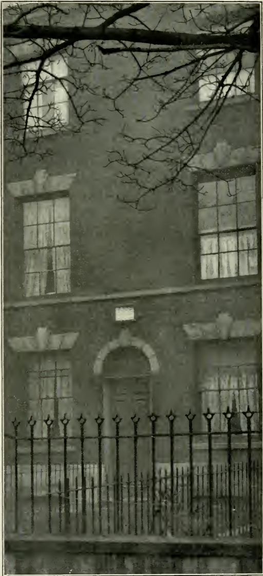
WILLIAM BOOTH'S BIRTHPLACE (Nottingham)